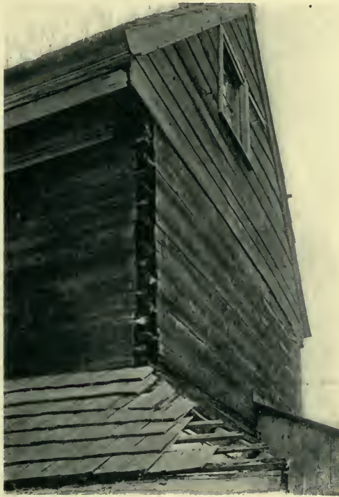
"THE WILLOWS," GLOUCESTER, NEW JERSEY The walls were built of three-inch planks dovetailed together at the corners. Built about 1720

I sailed up the York River to Rosewell in a log dugout. How we got there I do not know, but this I remember with pleasure, as I remember the constant courtesy of those Virginia folk, that those at Rosewell permitted me to sketch the beautiful details of that supreme expression in architectural history without any objection.